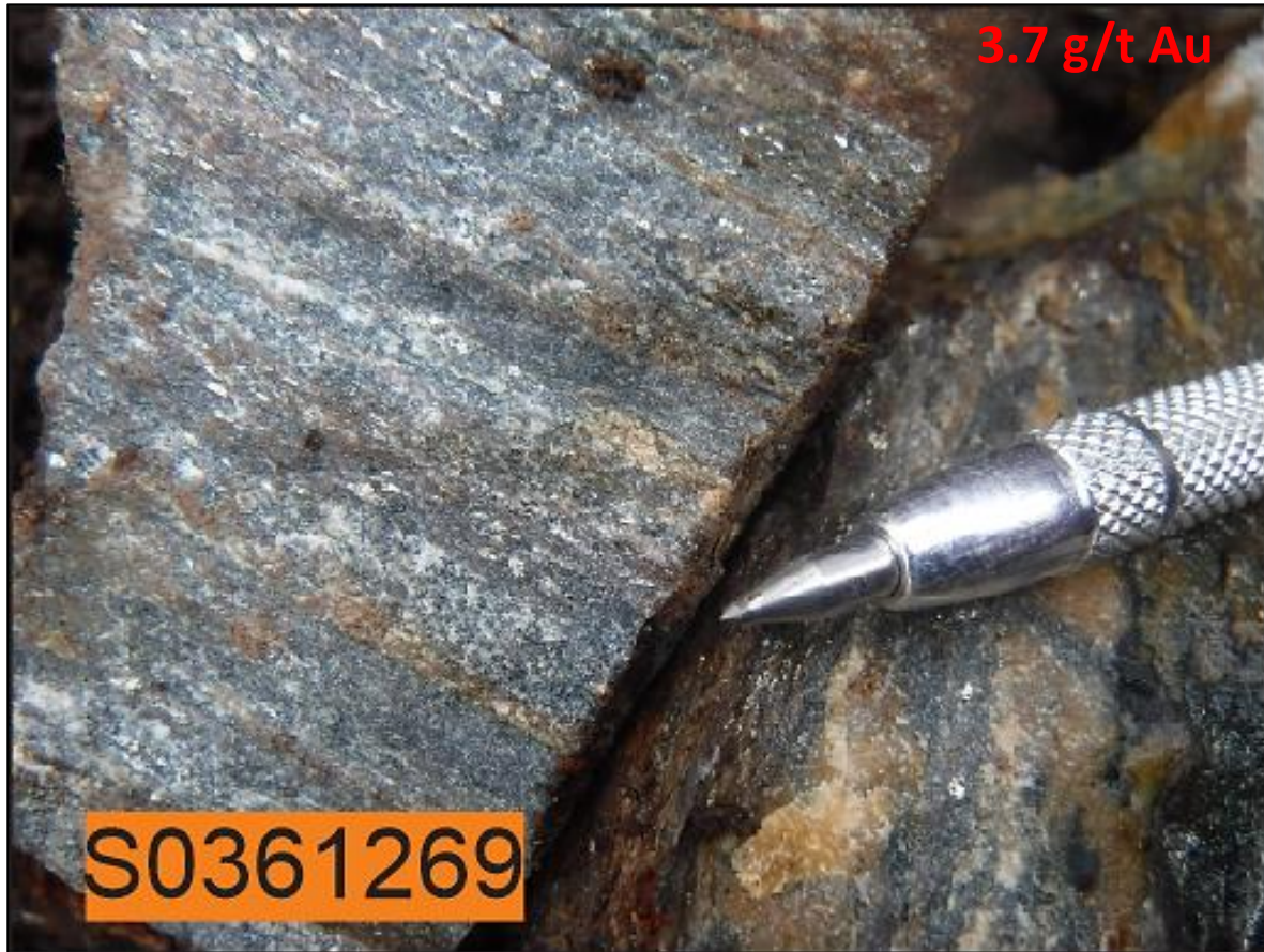
New shear zone - West